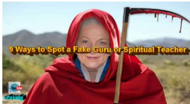
Nine ways to spot a fake guru.

You can help spread the truth by circulating these messages across your mailing lists and social media contacts.